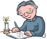
From Father's Desk